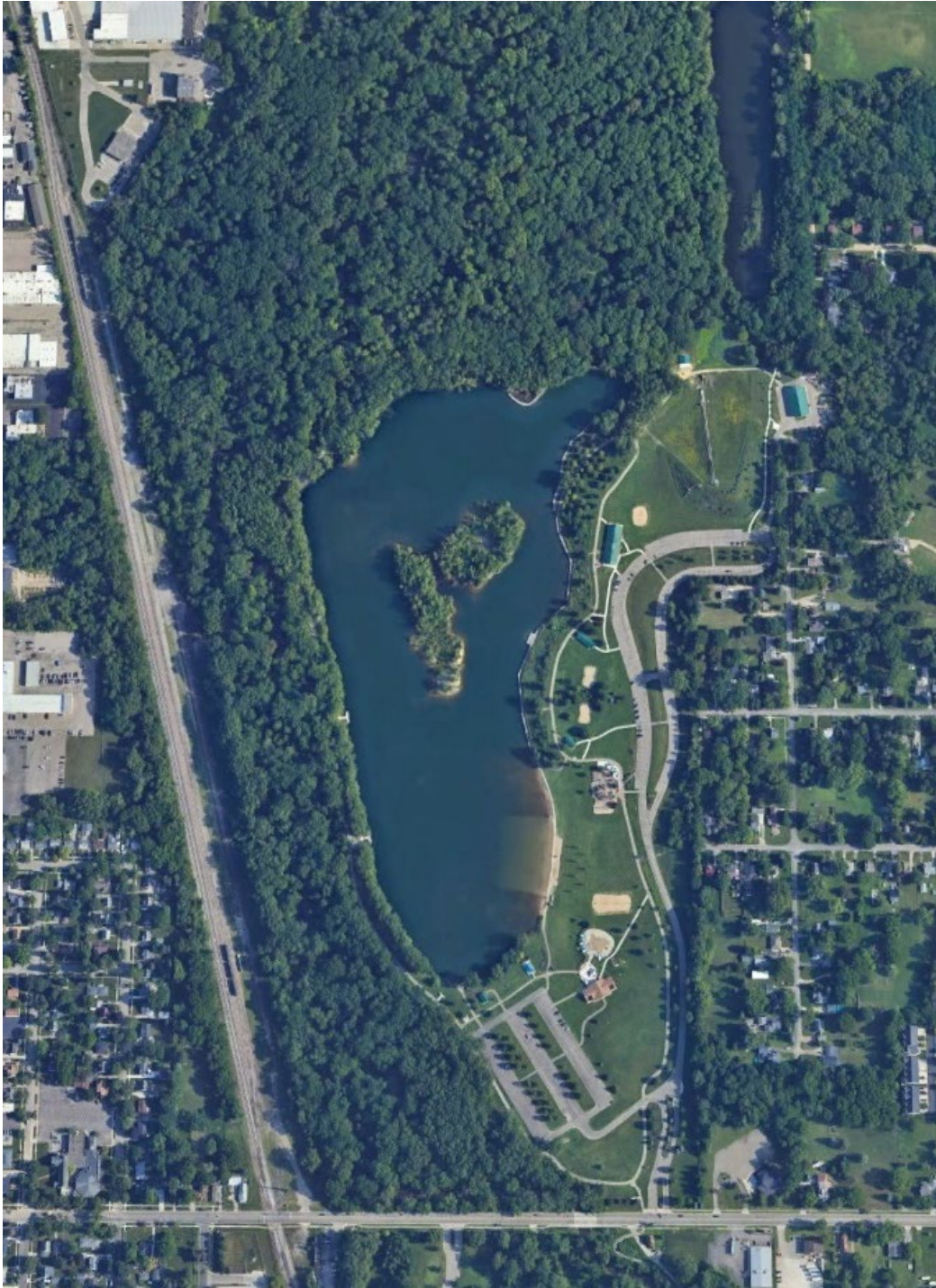
HAWK ISLAND August 1, 2023