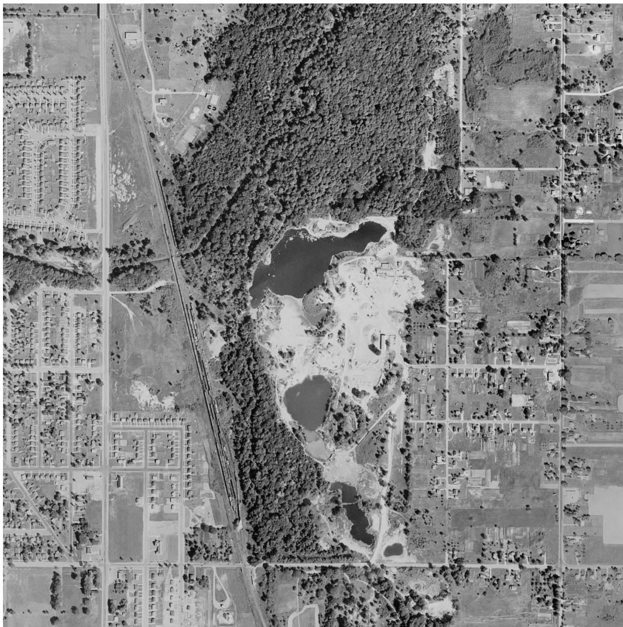
Hawk Island September 7, 1955