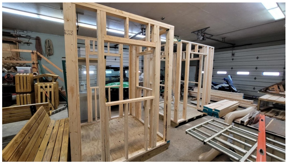
Valentine's Day Special Riverbend and McNamara Landing Gatehouse Construction