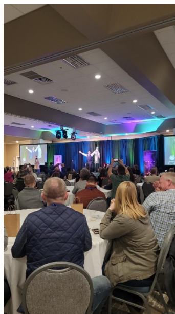
Conference Opening Speaker