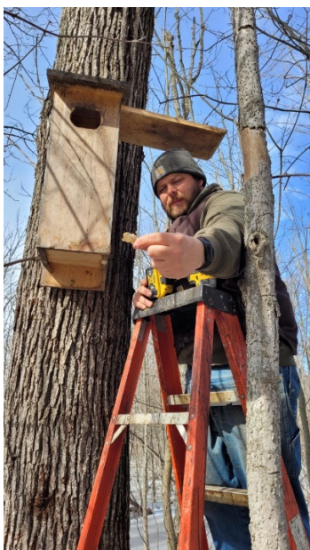
Wood Duck Nest Cleaning