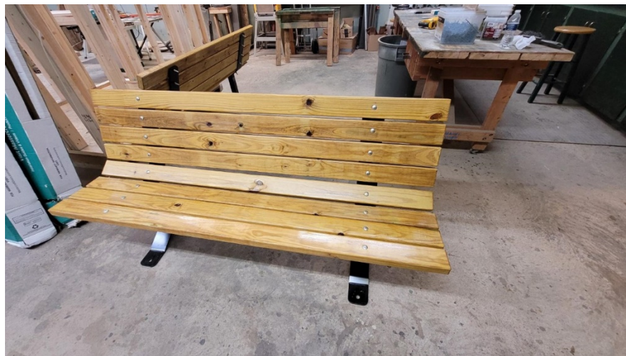
Assembled Park Donation Bench