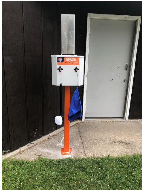
New kayak invasive species removal (lan)