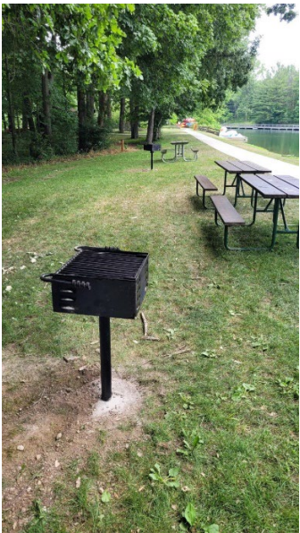
New Beach Grills