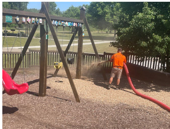
Installation of playground safety surface (Part of Playground safety monies)