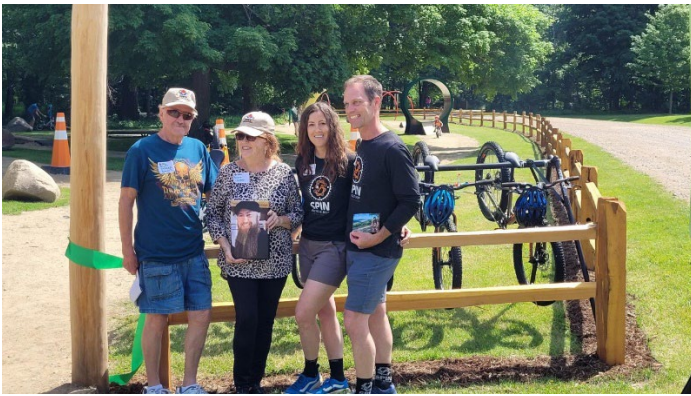
Spin Cycle Team at Dirt School Ceremony