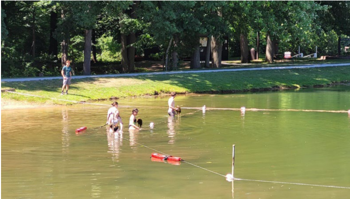
Lifeguard In-Service Training