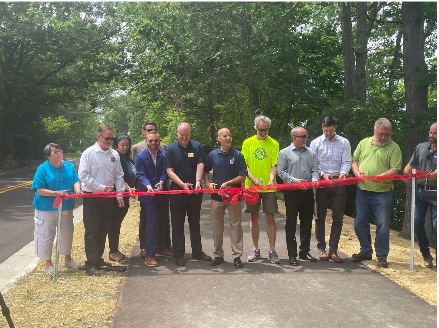
TR062 Cambridge to Frances River Trail Connection Project Ribbon Cutting