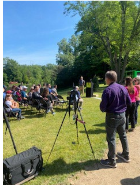
Dirt School Ribbon Cutting