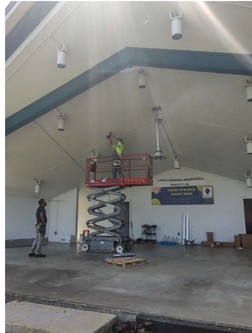
Band Shell fan installation