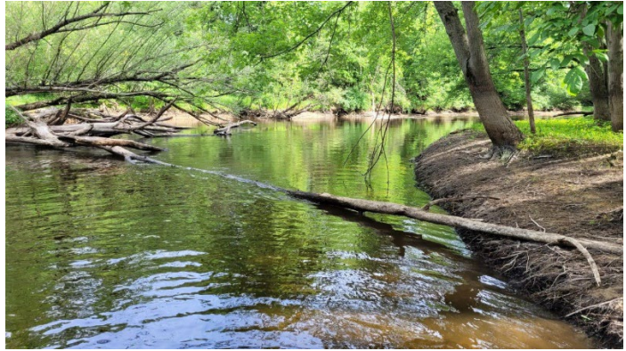
Grand River Tree Cleanup