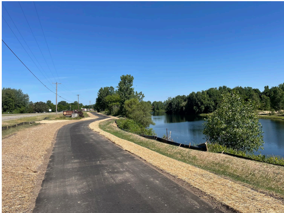
Delhi Township project - section of the Holt to Mason trail on the northeasterly side of Cedar Street near Esker Landing