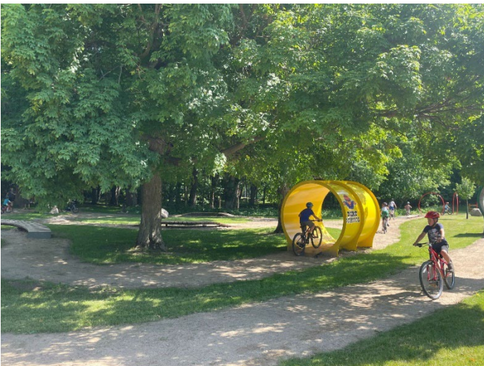
Dirt School Ribbon Cutting Ceremony