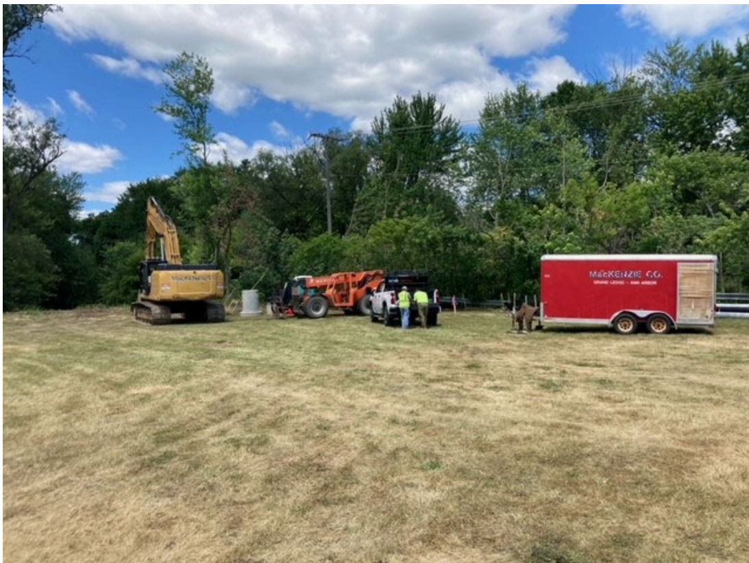
Project TR069 Williamston - Downtown Water Trailhead and Launch Construction begin June and expected completion October