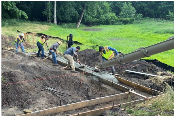
First concrete pour for new snow tube/storage building