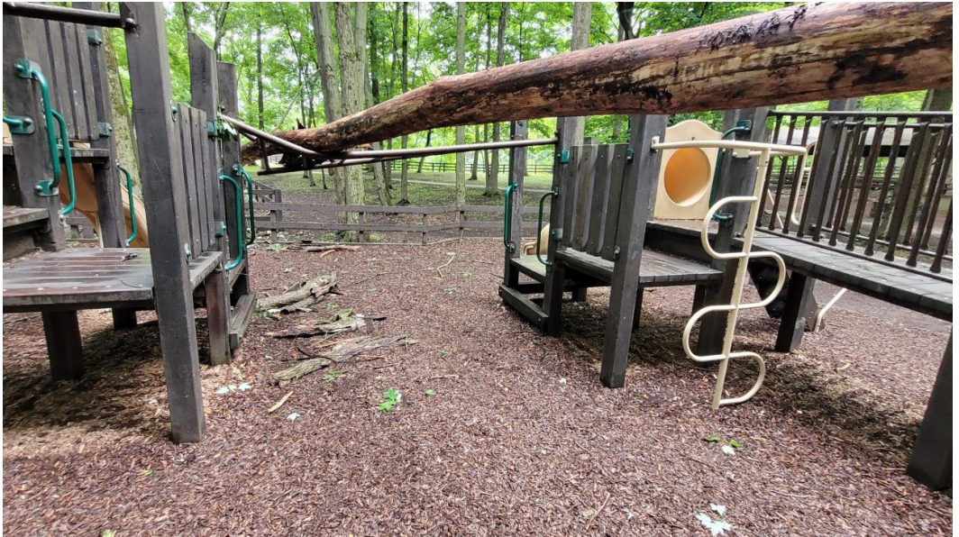
N. Bluff Playground Tree Damage