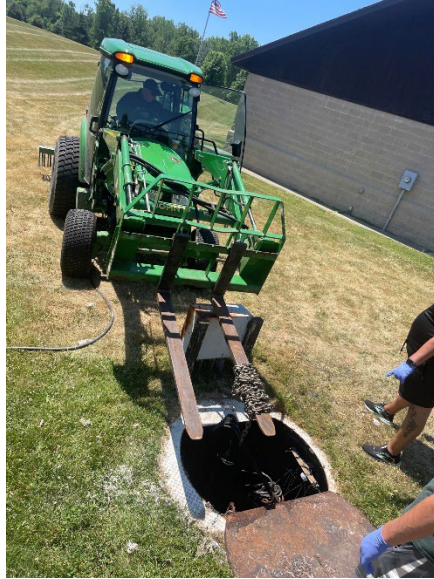
Repair of sewer lift pit