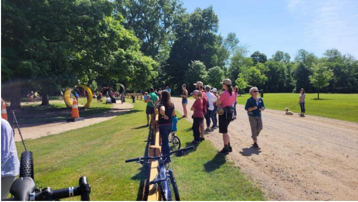
Kids and Families Enjoying the New Facility