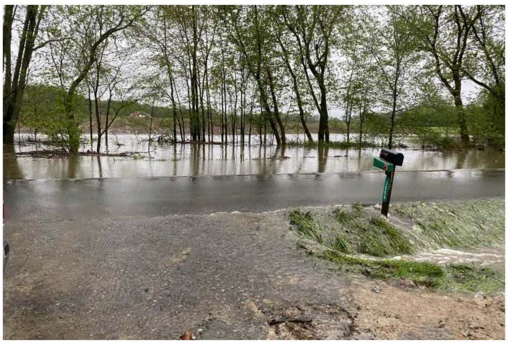
Smith and Oesterle Drain Photo date: 20200518 Looking northerly across Frost Road in front of 3860 East Frost Road. The Smith and Oesterle Drain, at this location, is an open channel on the north side of Frost Road and runs easterly, through a tile, to its outfall in the Dietz Creek Drain.