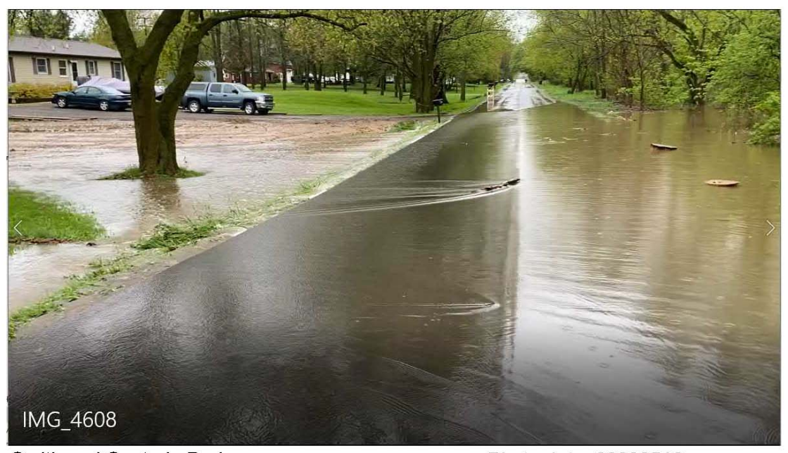
Smith and Oesterle Drain Photo date: 20200518 Looking west along Frost Road in front of 3860 East Frost Road. The Smith and Oesterle Drain is an open channel immediately to the north (right hand side) of the road. Still photo taken from video.