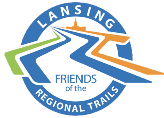
Coffee & Cleanup 10/5/19: