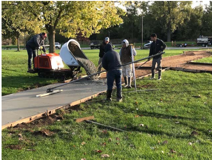
Repalcement Concrete walkways being poured