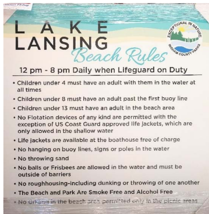
Beach Rules Sign