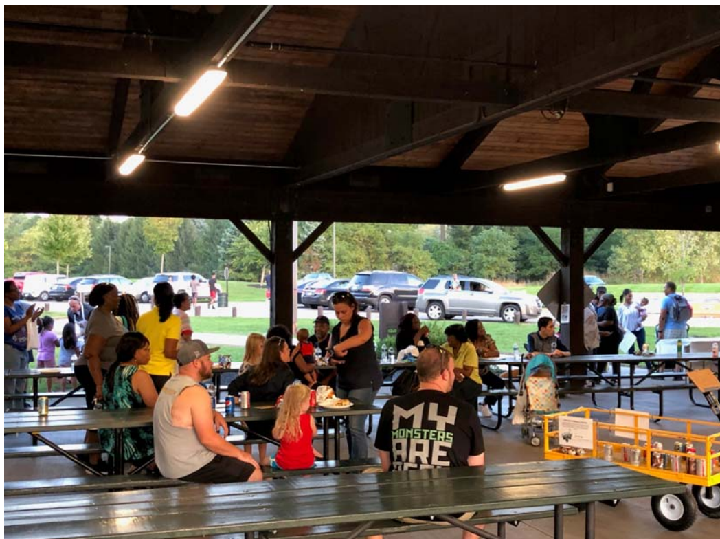
Ingham County Cultural Diversity Committee's Unity in the Community Picnic at Hawk Island