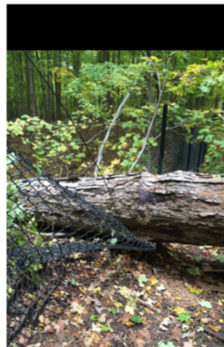
Tree over dog park fence