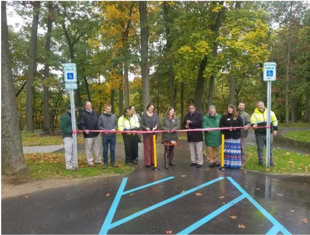
LLN Grant Project Ribbon Cutting

Ribbon Cutting for the Michigan Natural Resources Trust Fund Grant for park and accessibility and roadway improvements at Lake Lansing Park North. The Michigan Natural Resources Trust Fund recommended this project for funding and the project was completed late this summer.