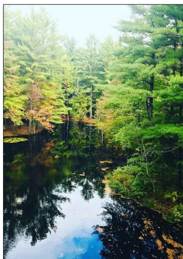
Whiting Forest, WIRED Event