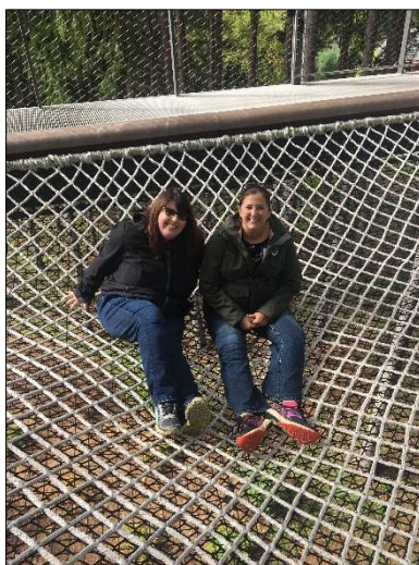
Whiting Forest, Canopy Walk