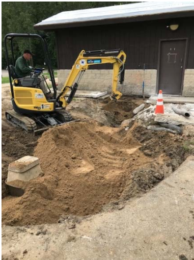
Water line repair