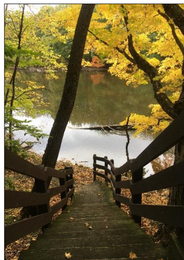
Burchfield Park, Stairs to River