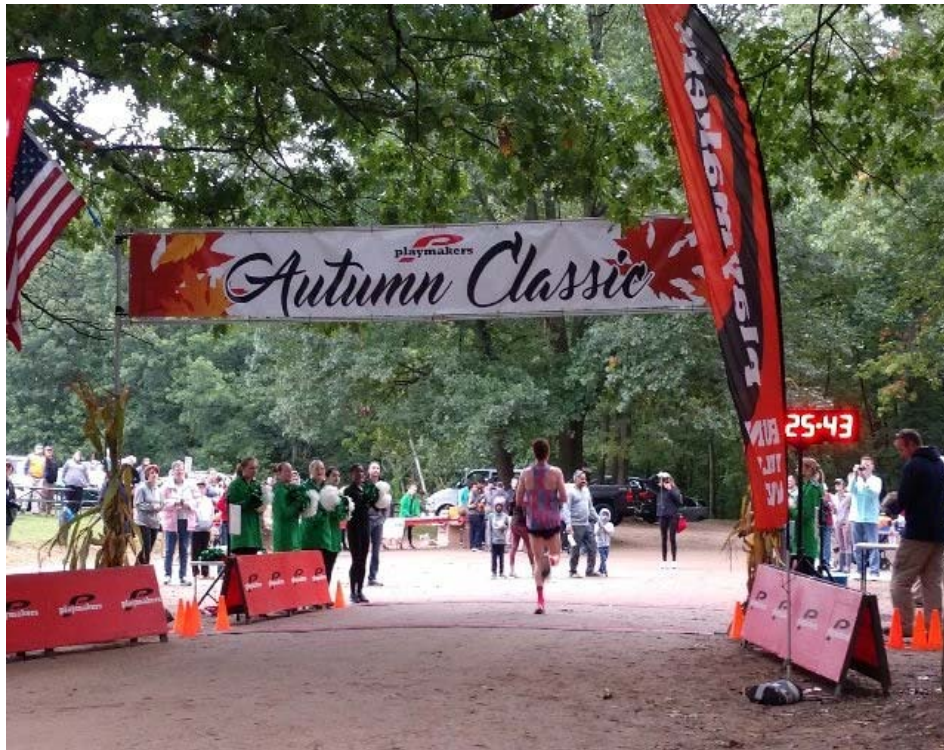
Playmakers Autumn Classic at LLN (over 1000 participants)