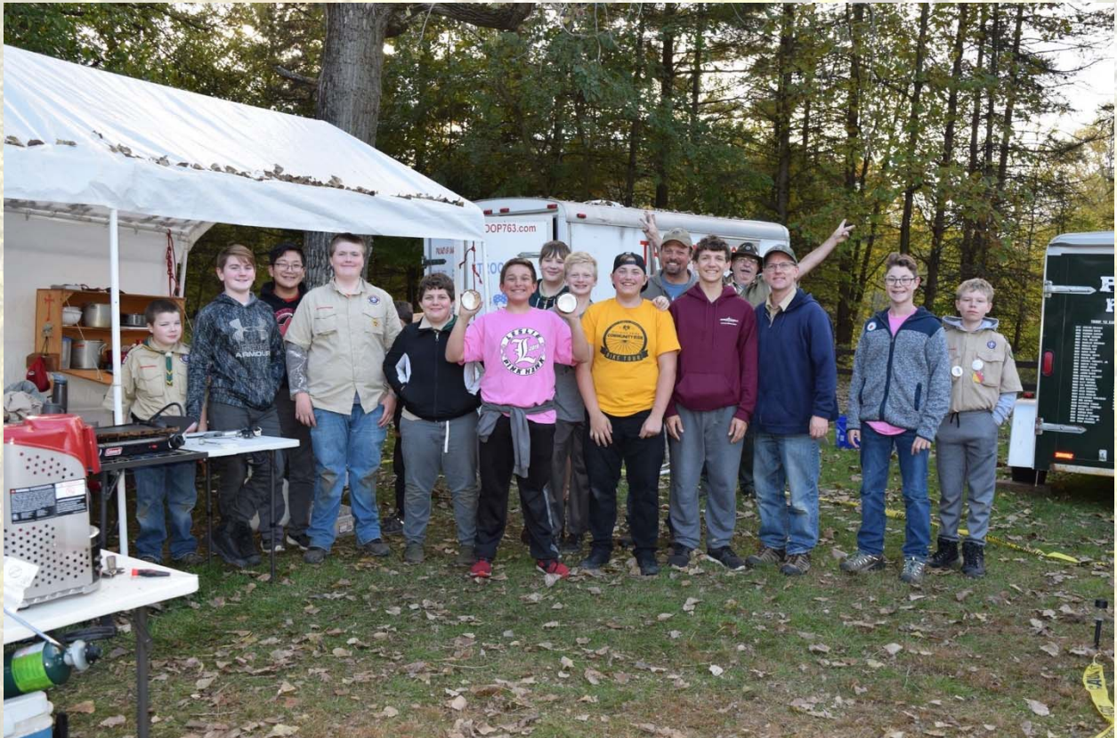
Chief Okemos District Annual Camporee