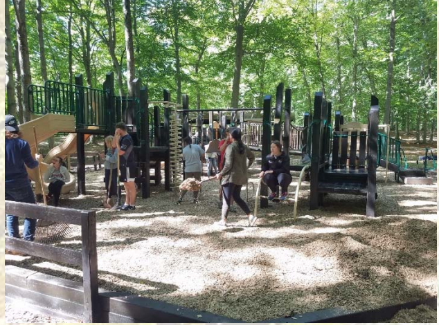
Mason High School senior fall workday at Burchfield