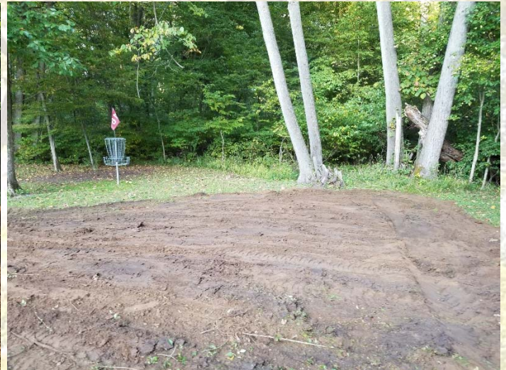
Pulling stumps with backhoe and cleaning up fairways on River's Edge Disc Golf Course