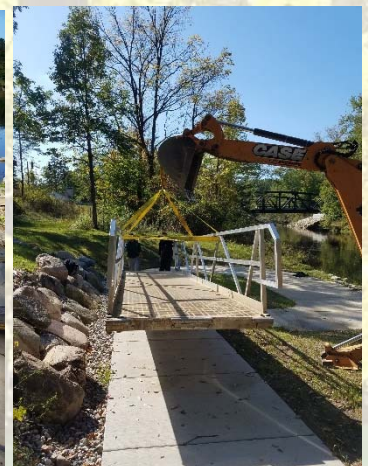
Removing EZ Dock for the season at McNamara Landing