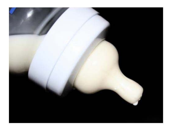
Infant and child nutrition is provided through programs such as Today's Mom.