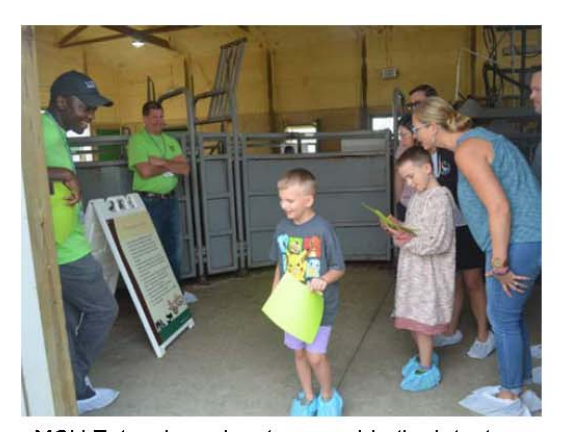
MSU Extension educators provide the latest information about beef production to the community.