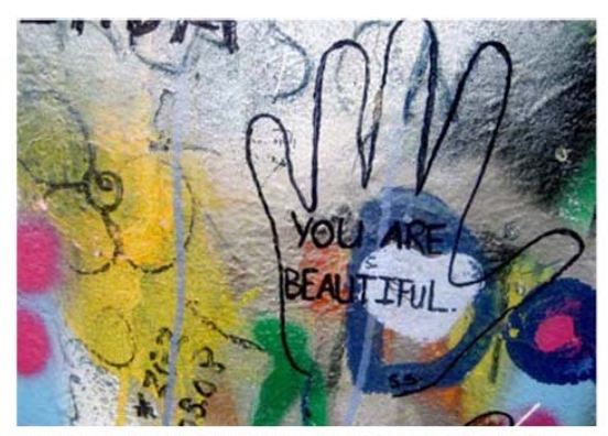
Safe and nurturing environments for our youth are critical and MSU Extension is ensuring that our volunteer process is secure and safe.