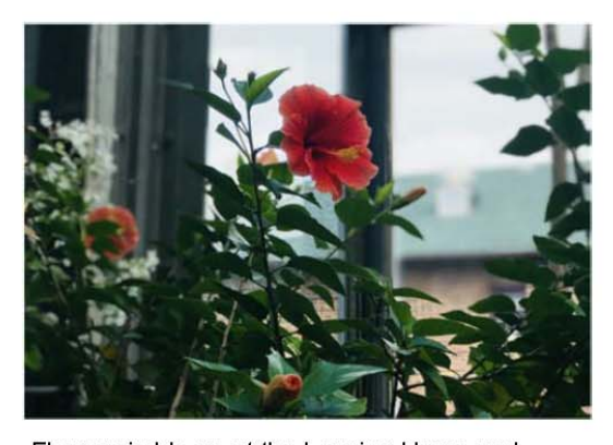
Flowers in bloom at the Lansing Home and Garden Show.