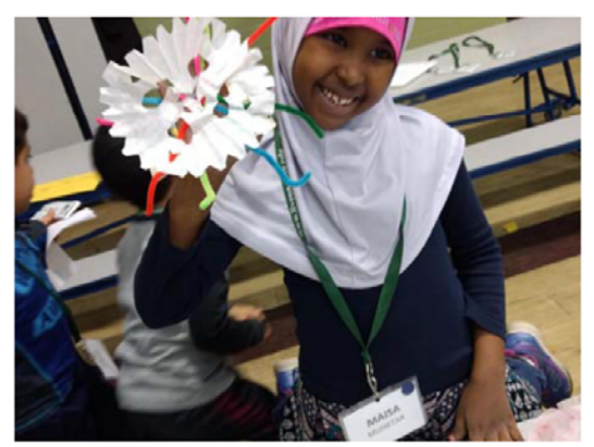
A 4-H SPIN club member proudly shows off her chromatography snowflake.